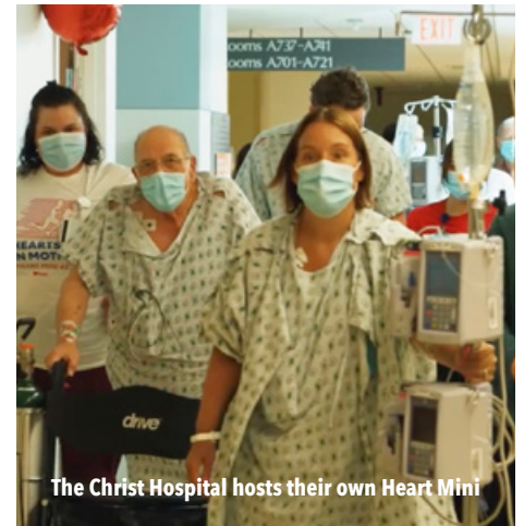
The Christ Hospital hosts their own Heart Mini