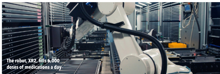
The robot, XR2, fills 6,000 doses of medications a day