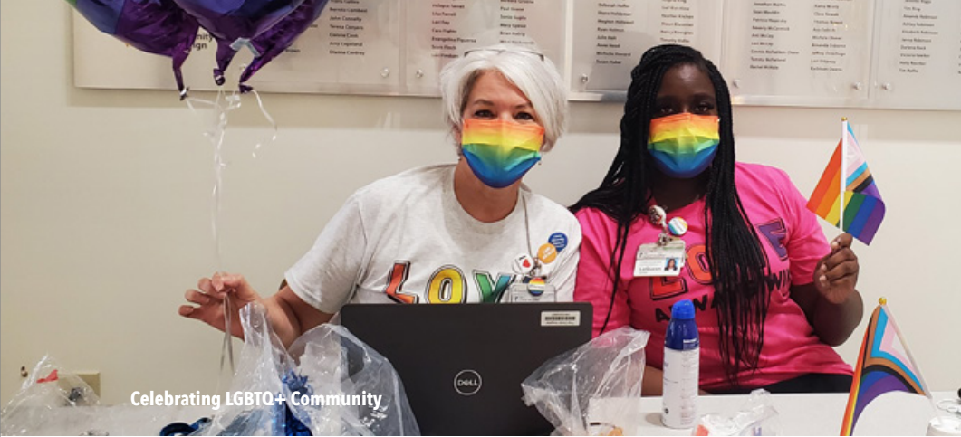
Celebrating LGBTQ+ Community