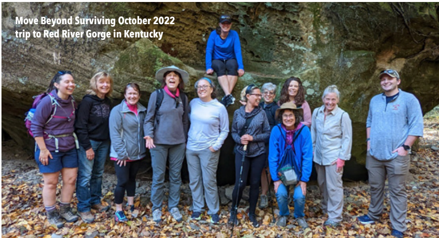
Move Beyond Surviving October 2022 trip to Red River Gorge in Kentucky

Cardiovascular Stepdown Unit (CVSU) staff in an on-site “Mini Heart Mini” Walk with running medals and snacks to make a great race. Those that participated in the Mini Heart Mini Walk celebrated their triumphs in heart disease and stroke recovery. Patients were given the option to walk a half marathon (half the floor) or a full marathon (walking the entire floor) with assistance from our team members. The event highlighted the importance of exercise being good for your heart. As part of Heart Month in February, The Christ Hospital Health Network was proud to highlight awareness of heart disease in women. The first Friday in February, team members wore red in order to ‘Go Red for Women’ Day. All throughout the month, providers highlighted the importance of heart health in women. Heart disease remains the number one killer of women and providing more tools and awareness is the key to reversing these trends.